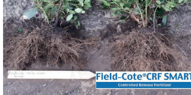
Planting hole application CRF-trial, Delphy – The Netherlands.

Field-cote®CRF SMART dosages per crop in kg / ha and gram / plant